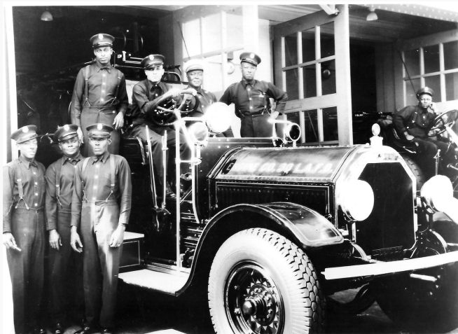
The "Colored Firefighters" (as they were called then) old Fire Station 30 when they were segregated (picture dated 1932).

The African American Firefighter Museum was opened at old LAFD Fire Station #30 at 1401 Central Ave near downtown Los Angeles on December 13, 1997. It was once one of two segregated fire stations operating within the Los Angeles Fire Department from 1924-1955.